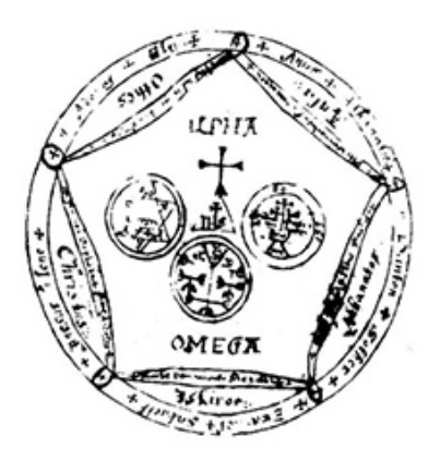
Fig. 7. Magical circle from an old sorcery and incantation manual