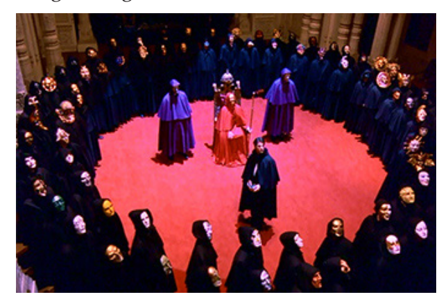
Fig. 6. Magical circle of an invocation ritual

In one scene in the film, there is presented, in a secondary plan, a Christmas decoration (fig. 5), which is actually the Star of Ishtar, known as the goddess who gives birth to the world. On one hand, she is loving, but on the other hand, she is revengeful, egoistic and unfaithful.