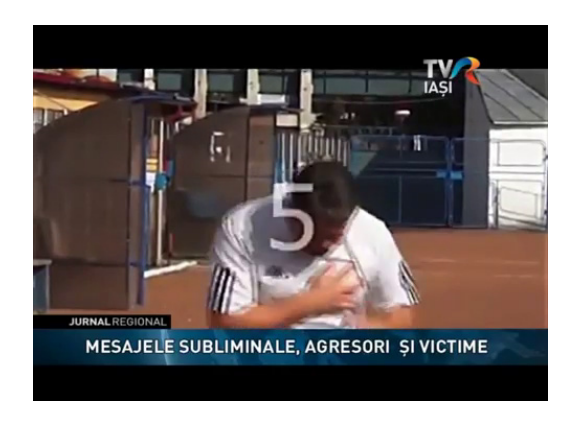
Fig.2. Subliminal messages, aggressors and victims with a posting number type message

The commercial without the inserted message has been tested on a group of volunteers, and the one with the subliminal message on another group of pupils. During the view, experimental data prevailed, by means of a cerebral headpiece that recorded the alpha waves, responsible for the concentrating activity, and the beta waves, specific to the dreaming area. The pulse and concentration of oxygen in the blood have been written down and the expressions of every participant at the experiment have been recorded with a video-device.