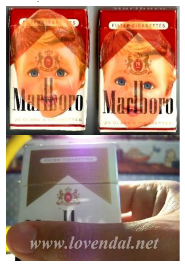
Fig.3. Marlboro cigars commercials

Marlboro writing is assimilated with a pyramid, a mason symbol.