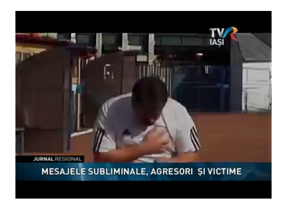
Fig. 1. Subliminal messages, aggressors and victims

Such a study has been developed in 2014 with the pupils of the "Petru Rares" National College in Suceava, who were asked to realize a commercial for a drug. In order to increase progressively the frequency of frames, they have imagined a child running and becoming a teenager, then an adult (Fig. 1). Exactly at the moment when the rhythm of the frames was of 25 Hz per second, they have introduced on the screen a posting number type message. (Fig.2).