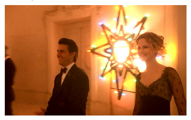
Fig.4. Artistic films with hidden subliminal messages

Not few are the artistic films in which hidden, subliminal messages predominate. One of them is Eyes Wide Shut , directed by Stanley Kubrick, with Tom Cruise and Nicole Kidman in leading roles (Fig. 4).